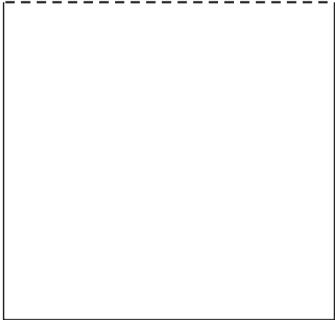
Partial Side Of Cart Pattern (Cut 2)