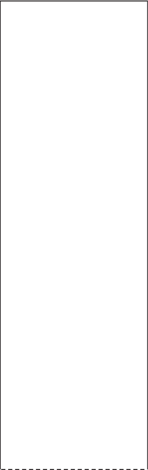
Partial Side Of Cart Pattern (Cut 2)