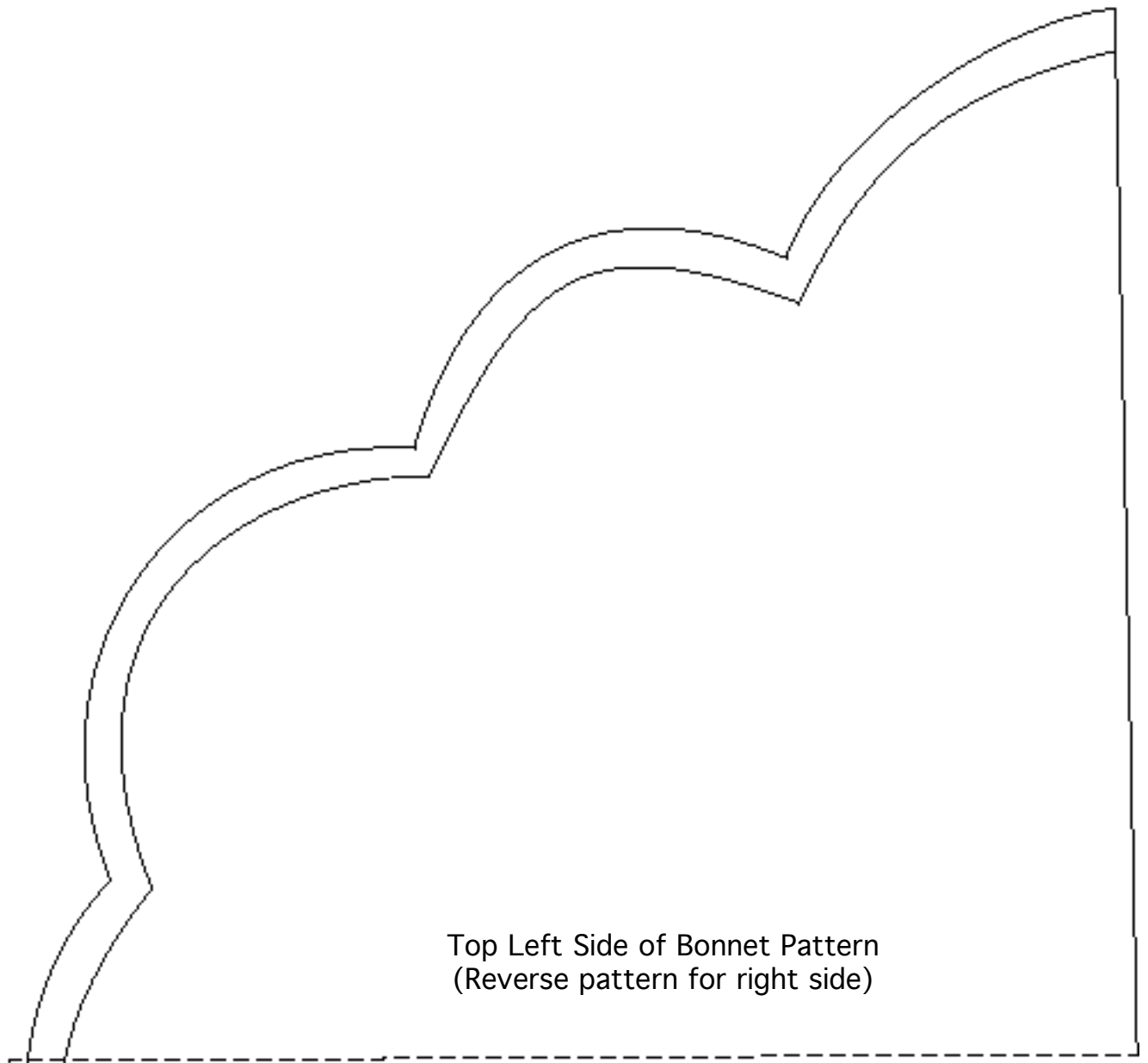
Top Left Side of Bonnet Pattern (Reverse pattern for right side)