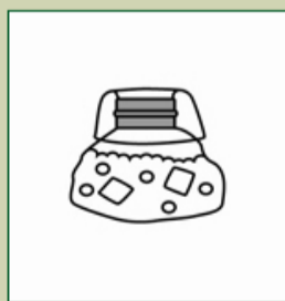
3. Fold bag over inner ring