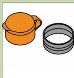
1. Take apart the two pieces

Say goodbye to twist ties, bag clips and storage containers! The Bag Cap collection is a convenient way to pour and store food in its original bag. A Bag Cap makes every bag a reusable container! Here's how it works: