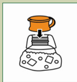
4. Position and press colored top until it pops into place