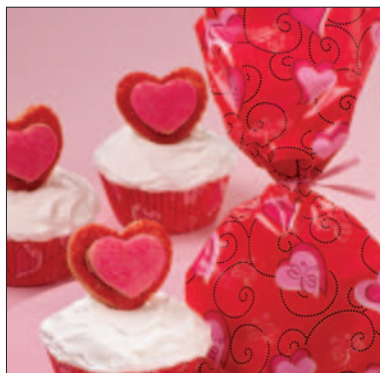
Got a Crush on You Cupcakes