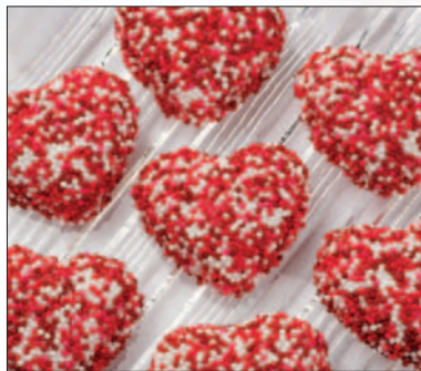
Sweet Love Cookies

Reduce oven temperature to 350°F. Place Sweetheart Bandana baking cups in standard muffin pan. Prepare cake mix following package directions. Fill cups 2/3 full; bake 17 to 19 minutes or until toothpick inserted in center comes out clean. Cool cupcakes completely. Ice cooled cupcakes with icing; insert cookies, mounding additional icing if necessary. Convenience Tip: Substitute Hearts Remembered Icing Decorations for cookies to top cupcakes.