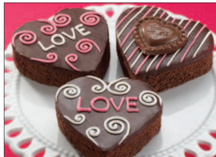
Valentine Brownie Points

Bake brownies in baking pan following package directions. Cool completely.